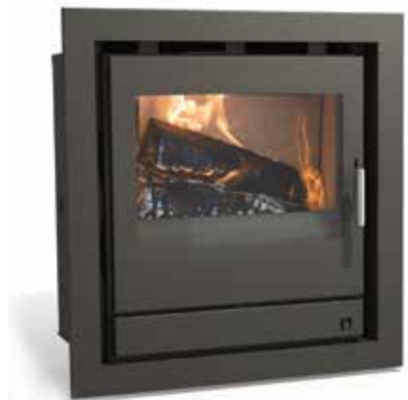
Ecoboiler 12 Cassette | 11.8kW A

Optional extras: Floor fixing kit / Safety handle