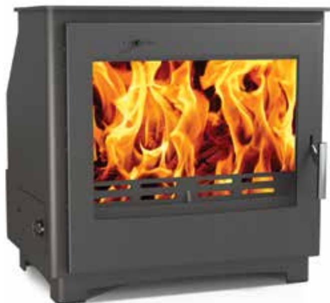
Ecoboiler Wood | 11.8kW A