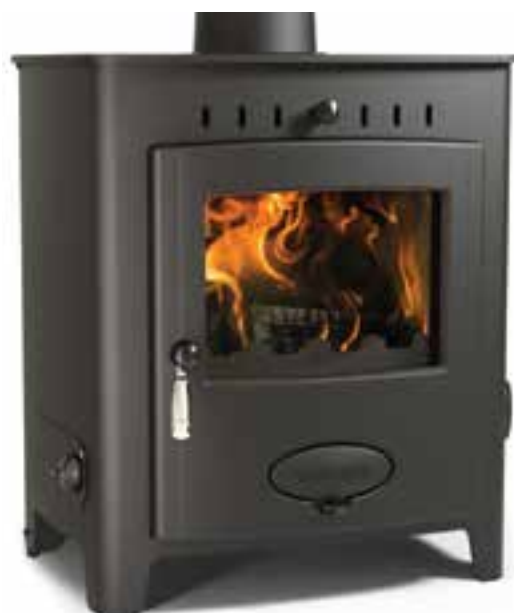
Ecoboiler 12 HE | 12.1kW A

Available with 9, 12.1, 13.6, 18 or 22.5kW outputs