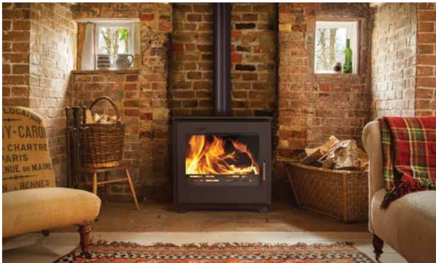
Model shown: Ecoboiler Wood

Our dedicated wood boiler features one of our biggest viewing glasses, providing an unhindered view of its glowing fire. Featuring a modern design, clean-cut lines and a sleek handle, the wood boiler is certain to become the centre point of any room in an energy-conscious home.