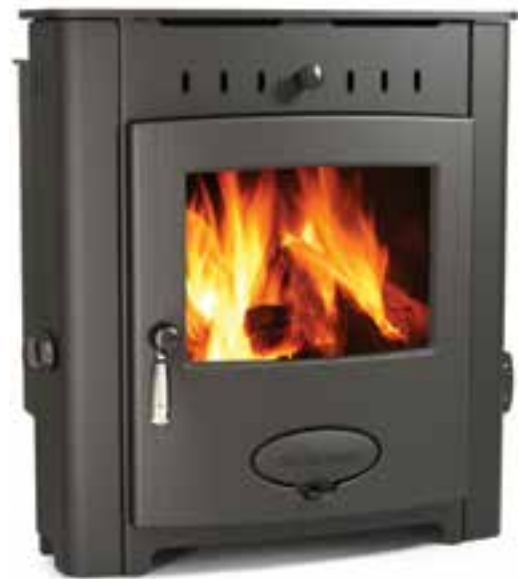
Ecoboiler 16 HE Inset | 16.1kW A