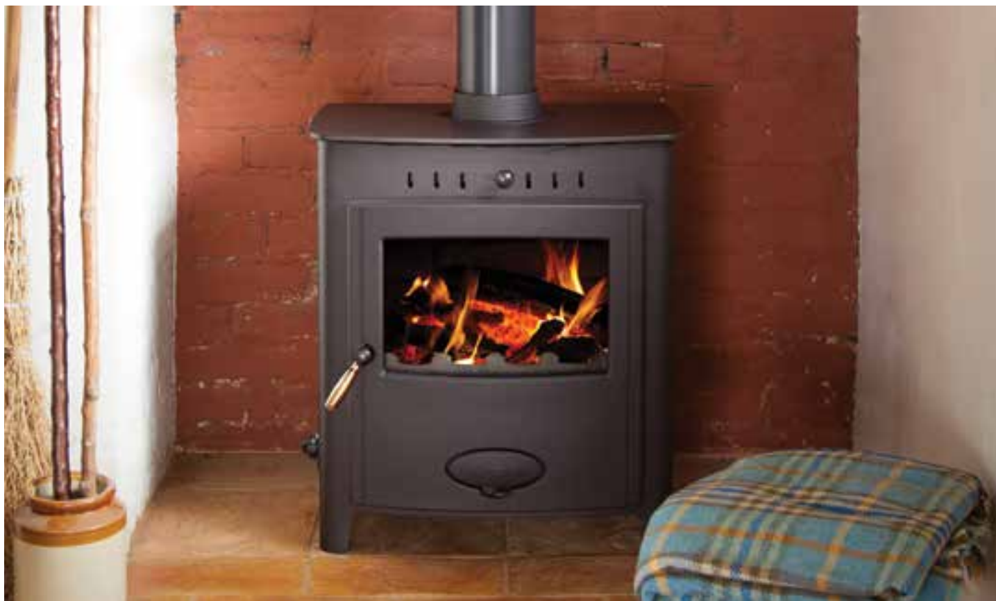
Model shown: Ecoboiler 16 HE | 13.6kW

Providing more than just superior performance, the Ecoboiler HE (high efficiency) has a large fire door glass and soft curved lines, offering an attractive focal point for any living area. On top of its stylish appearance, discreet thermostatic control and three bar operating pressure, its ability to produce 50% more heat to water than other boiler stoves ensures the Ecoboiler is the ultimate heating companion.